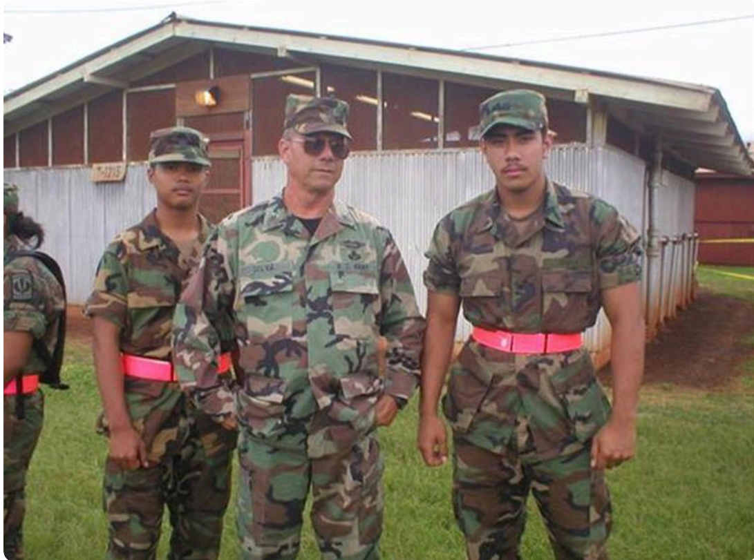
JROTC Spring Camp